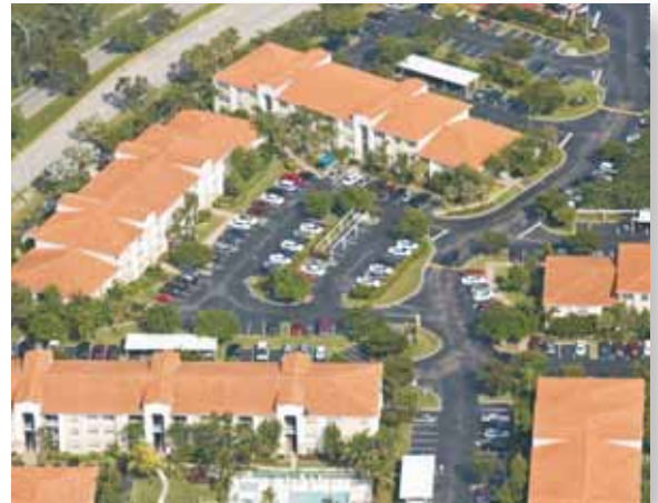
Park Colony Apartments

Crystal Cove Apartments Seattle, WA 2450 Squares Composition Shingles