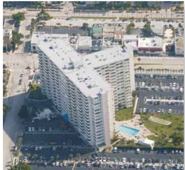
Coral Ridge Towers East Ft. Lauderdale, Florida

Oceanpoint Miami, FL 278 Squares BUR/Modified Bitumen