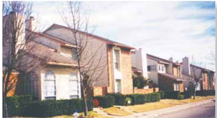
Creek Bend Townhomes

Village on Preston Garden Homes Dallas, TX 1450 Squares Composition Shingles