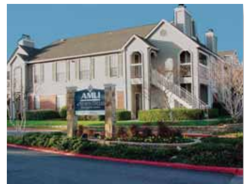
Amli at North Dallas