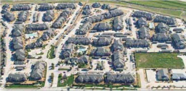
Karrington / St. Marin