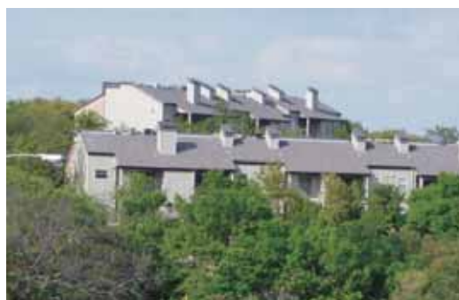
Indian Creek Apartments