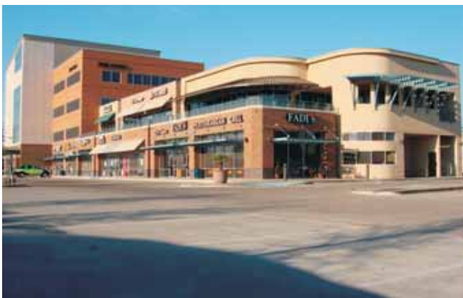
Knox Park Retail Center