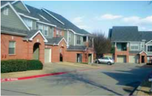
Prairie Creek Villas