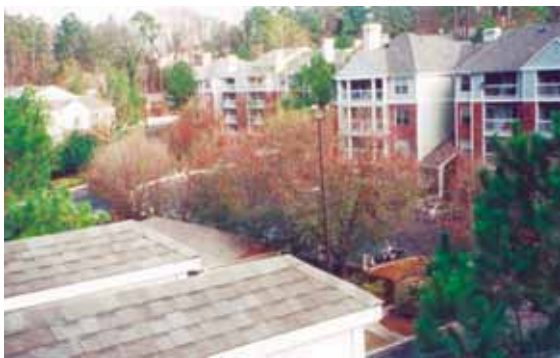
Amli at Clairmont