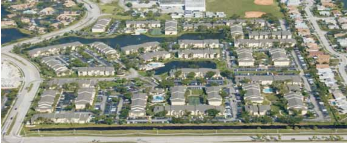
Sierra Point Apartments