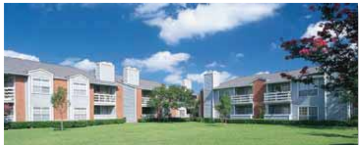
The Meadows Condominiums