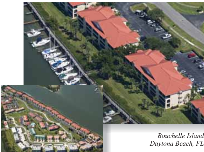
Bouchelle Island Daytona Beach, FL