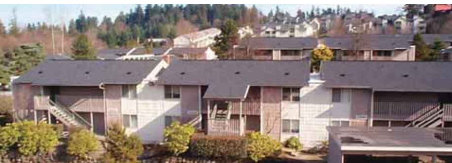
Meridian West Apartments