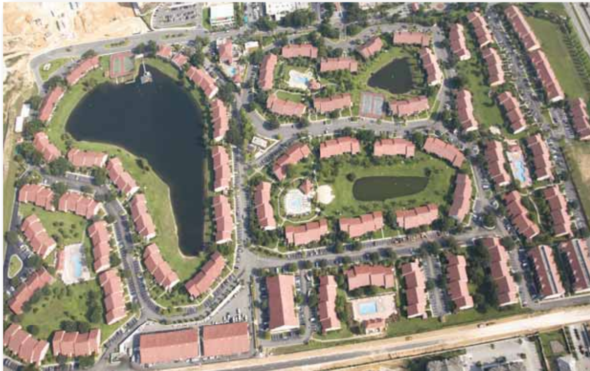
Westgate Vacation Villas