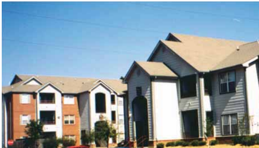
Pennsylvania Place Apartments