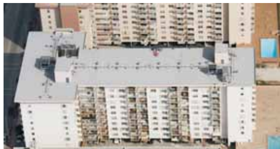
Ocean Point Condominiums