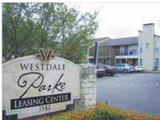
Westdale Park Apartments