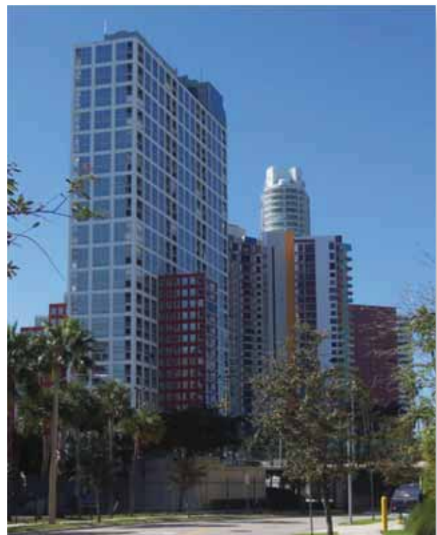
Brickle Mar Miami, Florida

Carlyle Towers Miami, FL 70 Squares BUR/Modified Bitumen