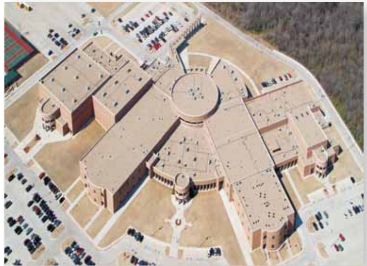
Timberview High School