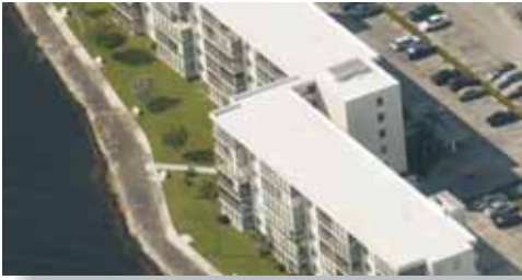
Point East Condominiums Miami, Florida