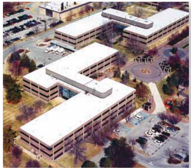
Monsanto National Headquarters