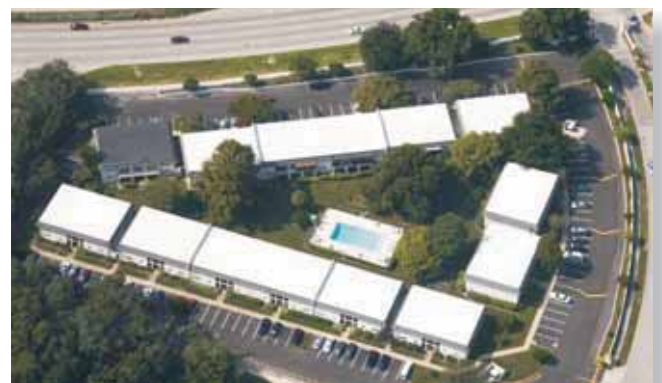
Altamonte Village II