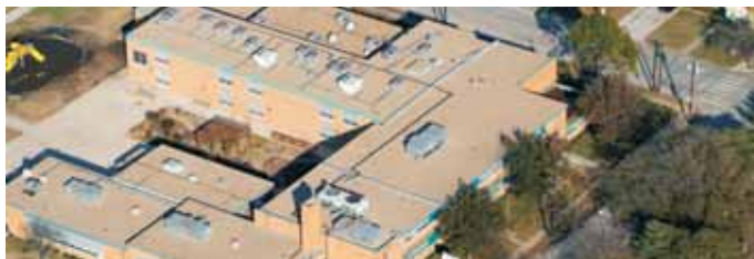
Springdale Elementary School

Springdale Elementary Dallas, TX 490 Squares BUR/Modified Bitumen