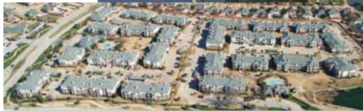
Amli at Breckenridge