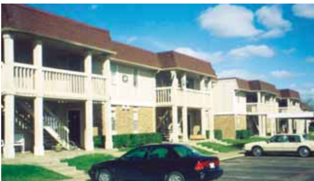
The Hamptons at Central