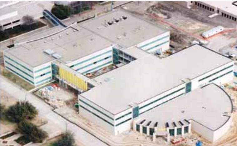
University of Texas Engineering and Science Building

655 Squares 20 Year NDL 4-ply Built-up 68 Squares Fully Adhered EPDM Single Ply