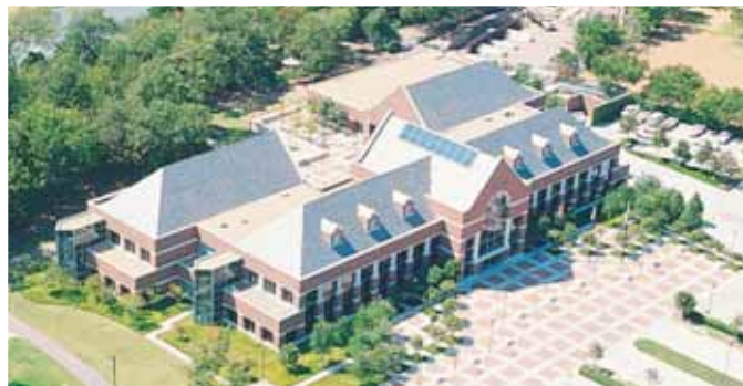
Farmers Branch City Hall