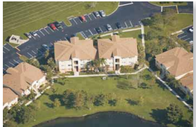
Lakewood at Emerald Hills