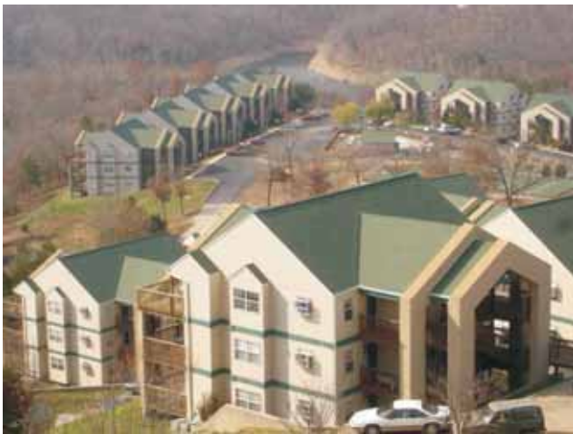
Eagles Nest Resort