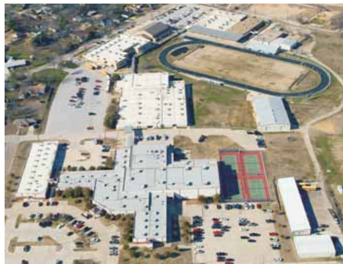
Grandview Jr. High